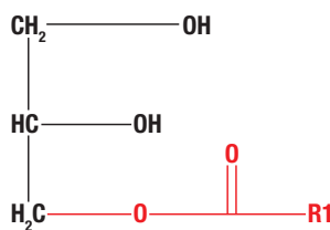
Figure 1. Monoglyceride Chemical Representation in MaxSimil Fish Oils (R1 = fatty acid)

Unique structure: One fatty acid attached to a glycerol backbone provides two polar ends that attract water and a non-polar tail end (R1) that attracts fat, thus enabling self-emulsification of the Omega MonoPure formulas.